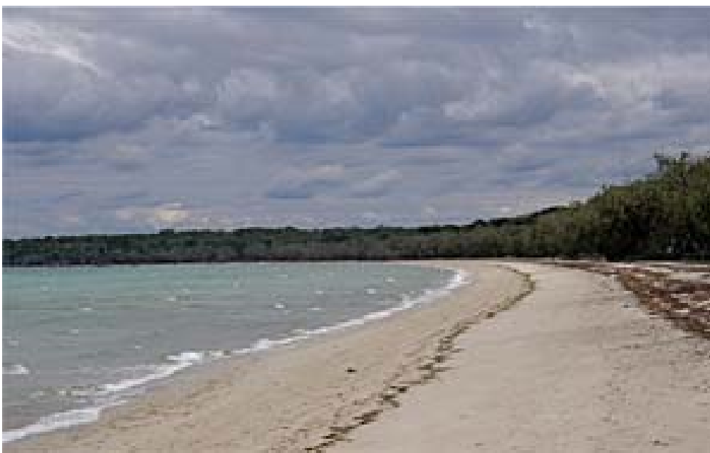
Above: Horseshoe Bay looking wilder than most visitors wish to experience. Conditions such as these present challenges for those wishing to get off the island by boat.